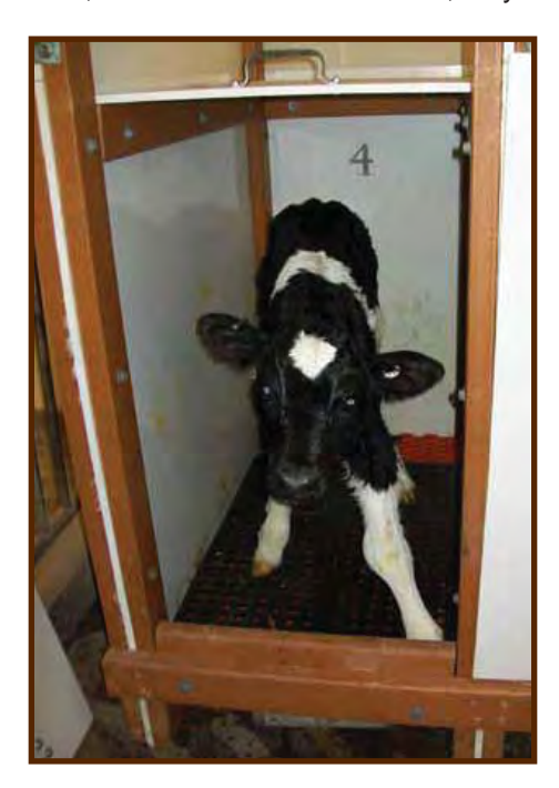
Calf warming boxes designed by the Michigan State University dairy team help control the spread of Johne's disease in the calving area.

To control the spread of Johne's disease in the calving area, farm employees designed warming boxes for outside of the maternity pens. Now, as soon as calves are born, they