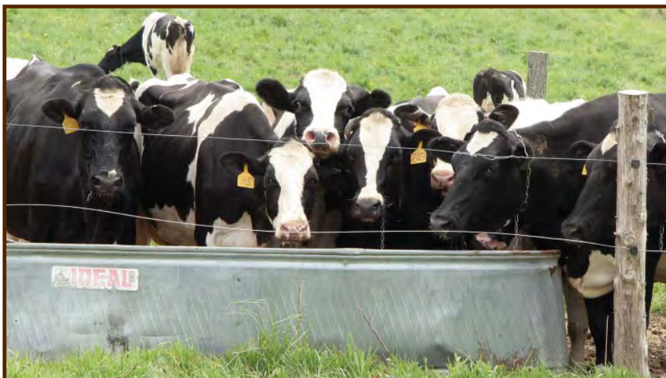
Water troughs provide a moist, nutrient-rich environment for bacterial survival, including the bacteria known to cause Johne's disease.

To inhibit the spread of MAP and exposure of susceptible animals to MAP on infected farms, best management practices aimed at maintaining biofilm-free trough surfaces should be included in any Johne's disease control plan.